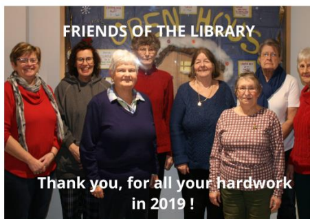
FRIENDS OF THE LIBRARY Thank you, for all your hardwork in 2019!