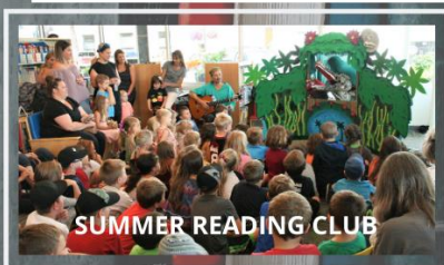
SUMMER READING CLUB